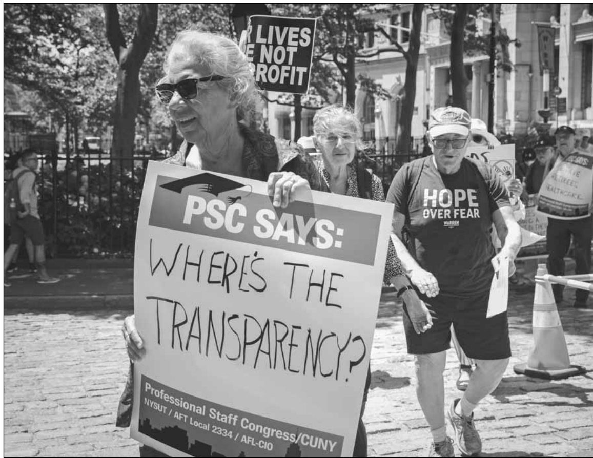
PSC retirees rallied against the plan this summer.

up funds for contracts and union welfare funds. In return for preserving no-premium health insurance and generating money for raises, the municipal unions agreed to work with city government to identify cost reductions for the city. All 153 contracts, including the PSC's, were resolved.