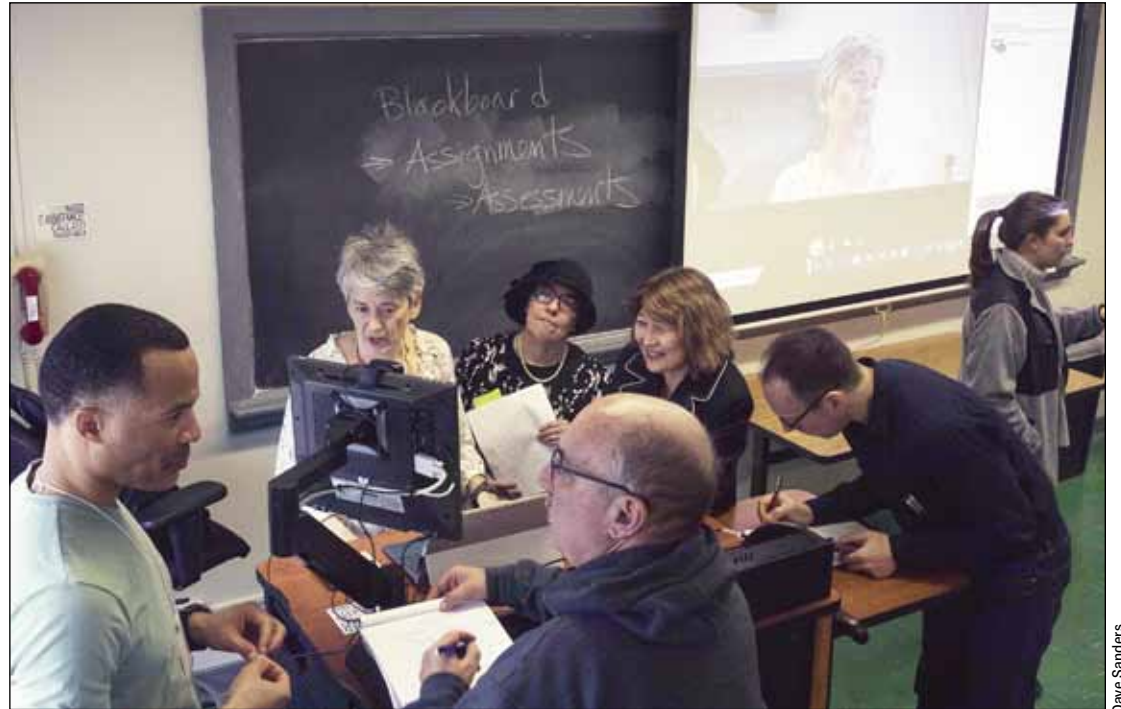
Faculty members at Brooklyn College received a training in remote teaching in March.