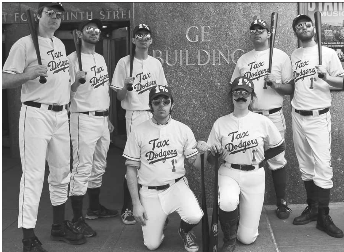
The "Tax Dodgers" showed up at GE Headquarters at 30 Rockefeller Plaza in January, then went on to visit Verizon, Goldman Sachs and other loyal fans. The team effort is part of a statewide campaign to close corporate tax loopholes (see page 3).