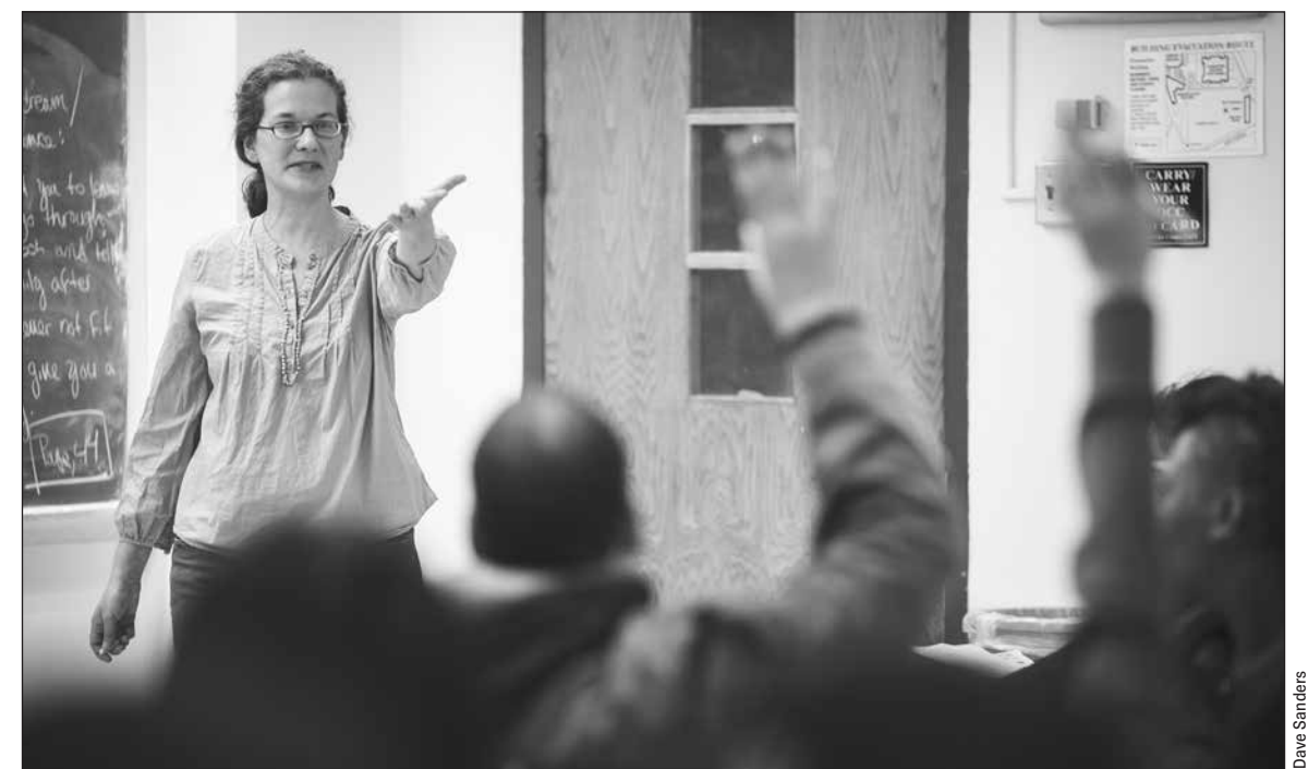
PSC faculty members have fought for – and won – a courseload reduction, but implementation remains an issue.

The agreement on the teaching load represents years of discussion and negotiation. We ask you not to squander its value by failing to stand up for the benefits you yourselves identified on the day it was announced. Do not accept the premise that austerity is the best we can expect of CUNY. The teaching load agreement provides a rare chance to do something that would make a tremendous difference to CUNY students and the university's academic stature. We urge you not to miss that chance. As department chairs responsible for academic g leadership among our faculty peers, we call on you to find the money and the vision – to implement the agreement so that it fulfills its abundant potential.