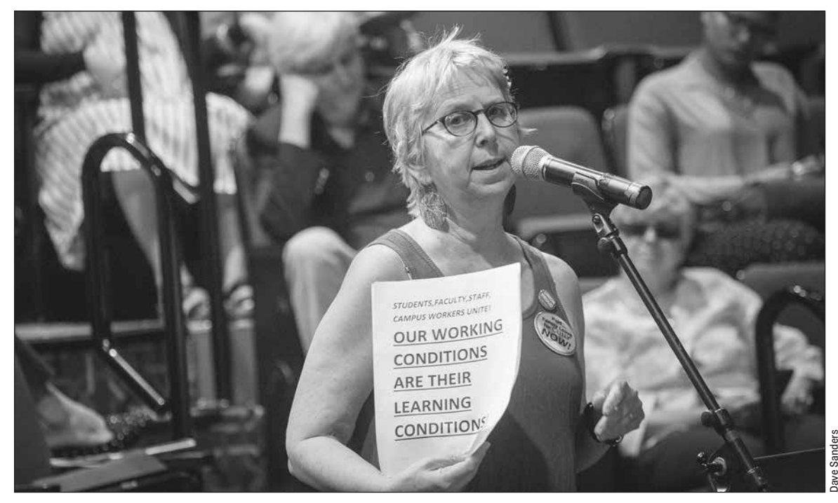
Adjuncts and other PSC activists testified about investment at CUNY, the teaching load reduction and adjunct pay.

The PSC's vision was one that would have included adequate funding for full-time replacement lines, some of which would go to qualified long-serving adjuncts. Instead, provosts and presidents are having to make choices that diminish rather than expand academic services: the availability of computers, space, and courses for students and the investment in professional development for faculty and staff are just some of the cuts that are being considered. Hints are given to the