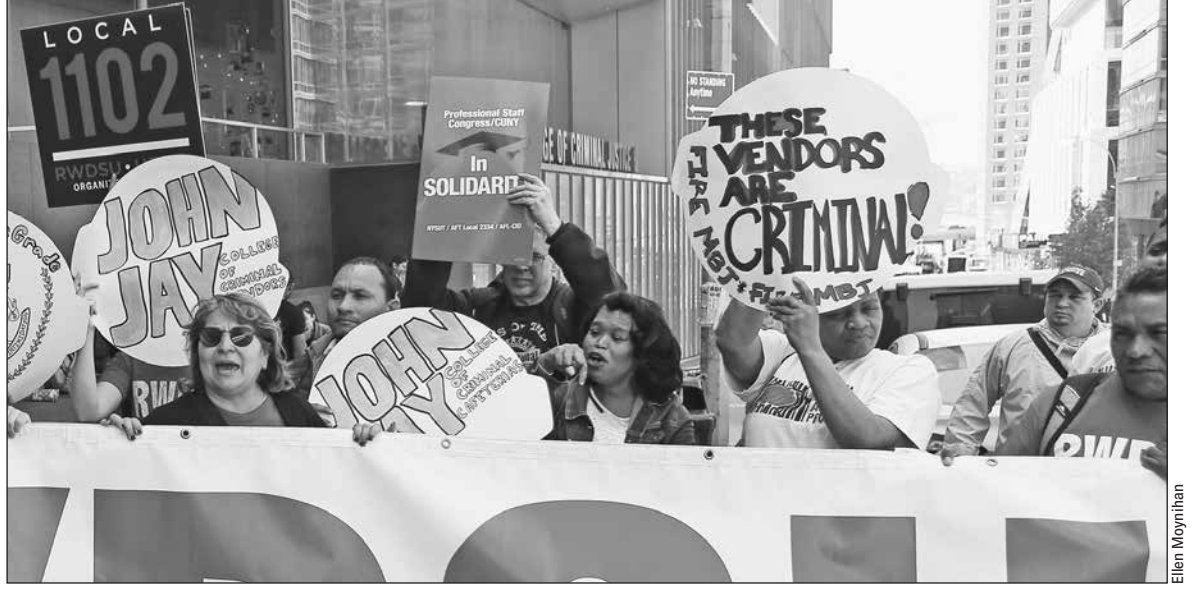
PSC members rallied with Retail, Wholesale and Department Store Union activists outside John Jay College in May, protesting the food service provider MBJ, who the RWDSU says has violated workers' rights at the campus.