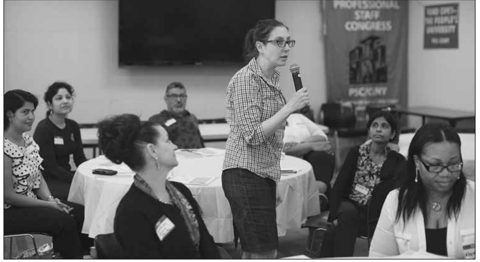
The PSC held a daylong event for junior faculty members, hosting discussions on how to navigate tenure and how to receive research grants.