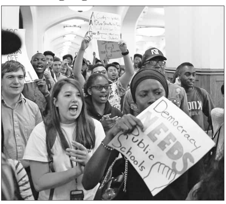
Dozens of students packed the hallway as they waited to be let in to a May Board of Trustees meeting at City College.

of students and a more multifaceted kind of pressure will be needed in order to squash it."