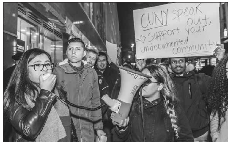
Students marched to demand a 'sanctuary campus' outside CUNY's central administration office in Midtown Manhattan.