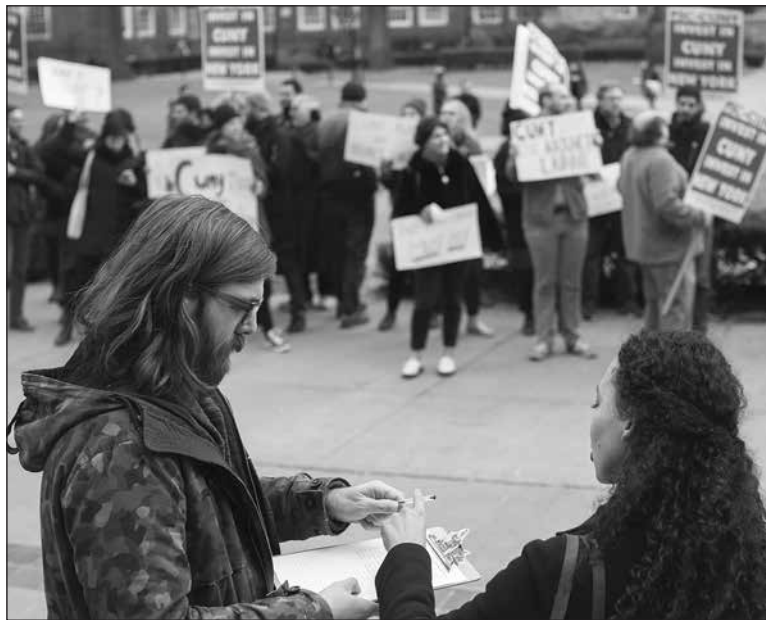
PSC members gathered statements of support from faculty, staff and students.

time on campus to be available for students. "We can't be here to support our students."