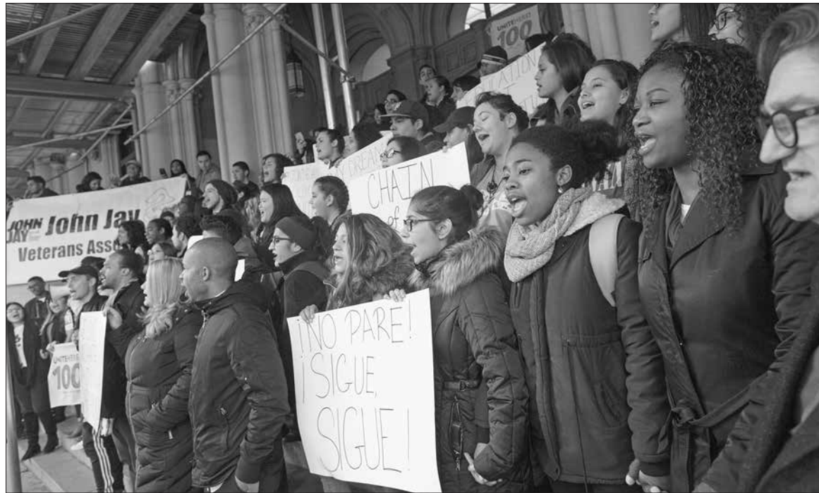
Students, faculty and staff formed a human chain around John Jay College's main building in calling for a 'sanctuary campus.'

ministration has initiated concrete steps toward protecting immigrants – although more needs to be done, advocates said.