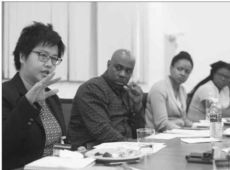
HEOs discussing contract implementation at a meeting at Borough of Manhattan Community College.

PSC-CUNY MOA recognizes “excellence in performance or increased responsibilities within the title.” The HEO labor-management committees currently being formed at campuses will have an initial say on whether an application for the $2,500 salary differential goes forward. (For a chart that outlines the steps in deciding salary differentials, go to tinyurl.com/HEO-salary-differential .) While the contract outlines the formation