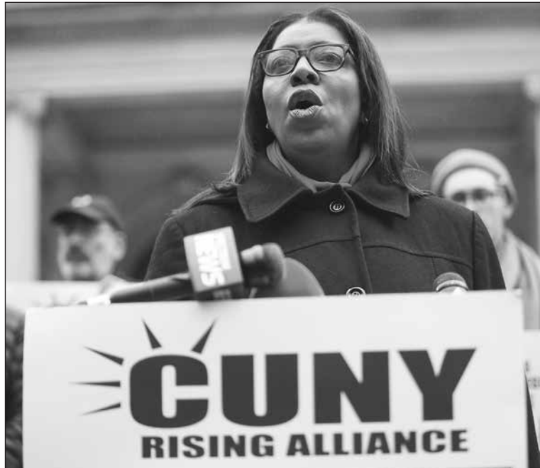
Public Advocate Letitia James joined CUNY Rising for the release of the white paper.

for just being on the defensive all the time, not just for fighting against the idea that CUNY should always be poor, but actually demanding a new vision of funding for CUNY, demanding that we rethink the agenda that has said for too long that CUNY is going to have to scrape by.