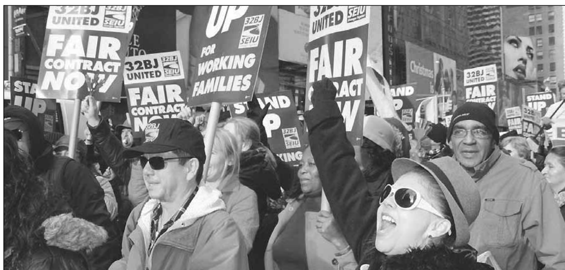
Members of Local 32BJ SEIU who work in 32 Broadway theatres celebrate on Dec. 13 after voting to authorize their bargaining team to call a strike if a new agreement is not reached when the current contract expires Dec. 30.