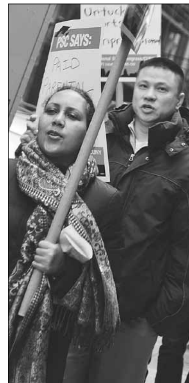
Picketing outside RF-CUNY headquarters on December 17.