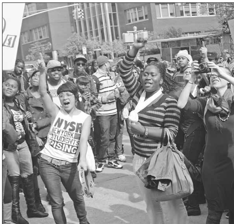
Several hundred Medgar Evers College students walked out of class Oct. 17 to demand the school's president and provost resign.