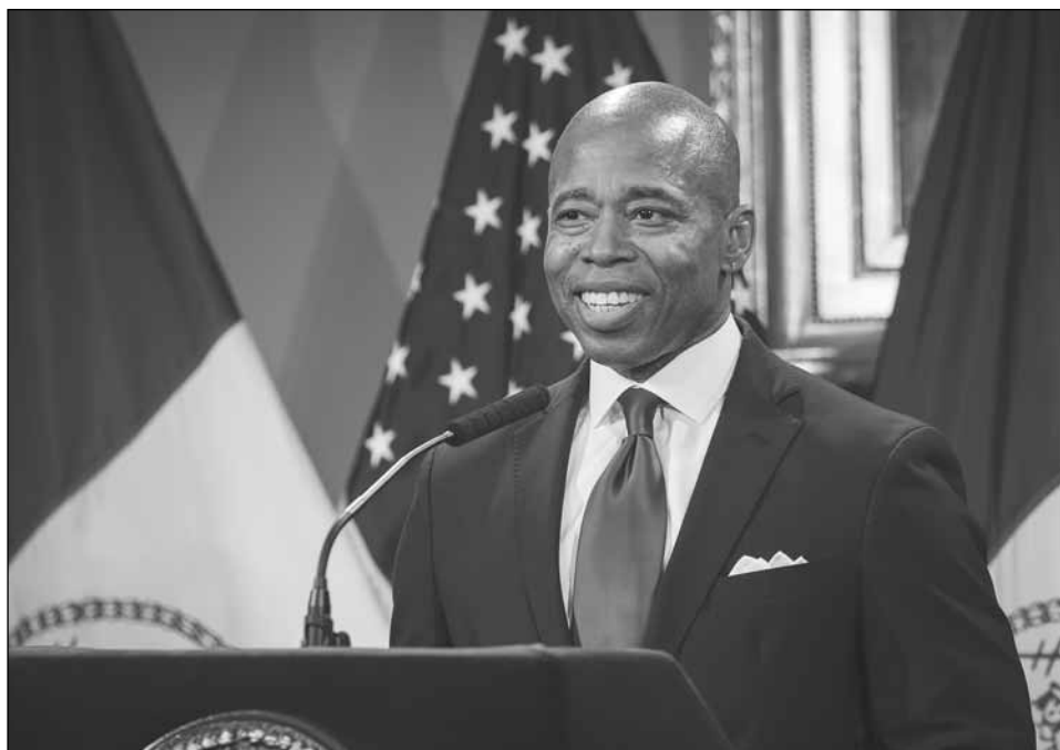
Mayor Eric Adams assumed leadership at the beginning of the year. PSC leaders have written to the new mayor, asking him to reconsider the privatization of health care for municipal retirees.

Among the menu of eight options, there were two with potential for major cost-savings that OLR-MLC did not pursue: (1) Exploring self-insurance (many states and cities self-insure to reduce costs); and (2) Municipal unions and the NYC government exercising their collective leverage to reduce runaway hospital costs. The PSC has