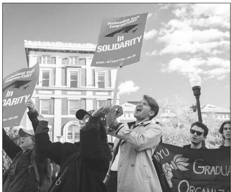
UAW Local 2110 members, representing graduate student workers at Columbia University, ended a tumultuous 10-week strike and ratified a contract that includes raises and increased benefits. PSC members rallied in solidarity with the strikers.