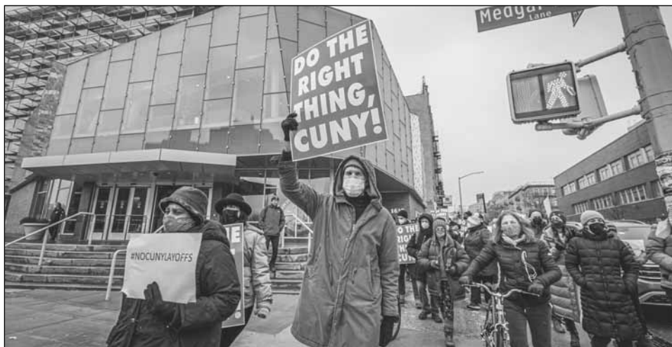
On the first day of classes, PSC members rallied at Medgar Evers College in Brooklyn.

The speed of Omicron's spread stood in sharp contrast to the slow pace of CUNY's