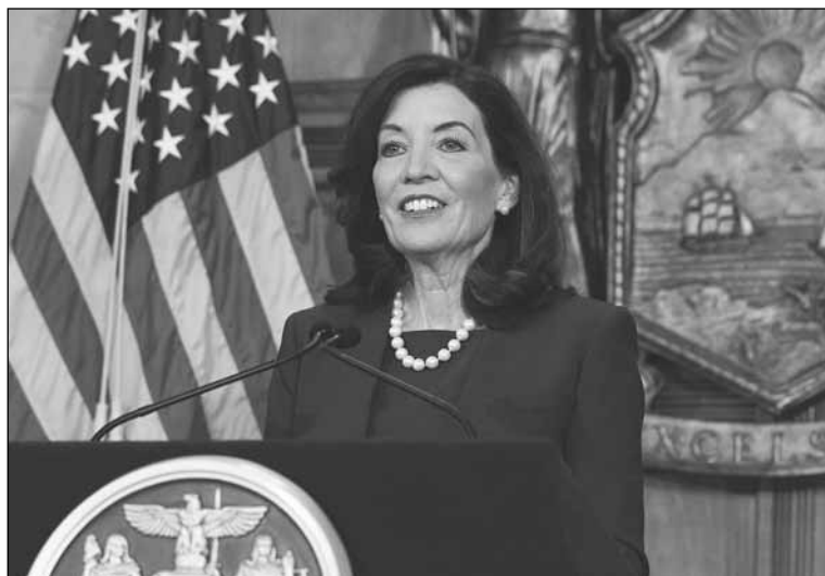
Office of the Governor

Governor Kathy Hochul has proposed funding for new full-time faculty at CUNY.