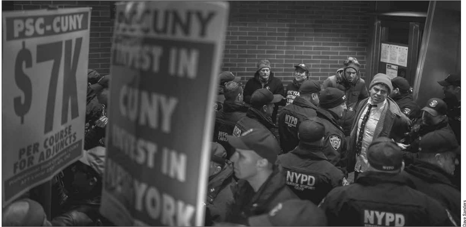
PSC members were arrested at a December 10 protest outside a CUNY Board of Trustees meeting. They were urging trustees to serve their mission and advocate for a budget that meets the needs of the university.

ees, do your job. Demand the funding CUNY needs!” We lined up in front of the doors where the Board of Trustees was meeting, moving to block the doors of the building.