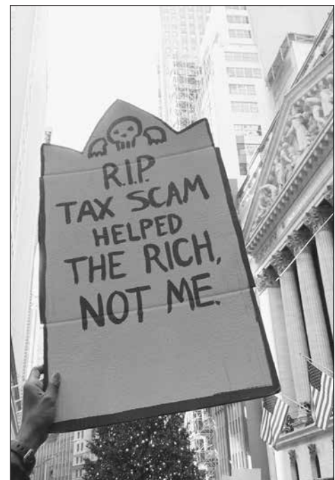
Outside the NYSE, PSC members protested corporate tax cuts that benefit the wealthy.

The signature contract demand is simple and bold. Wearing red $7K T-shirts and holding $7K posters, nearly 100 PSC members crowded onto the “million dollar staircase” in the State Capitol to press for the issue.