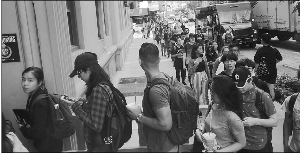
At the start of the fall semester, a long line due to out-of-service elevators trails out of 17 Lexington Avenue.

work in a building during major renovation should be revisited. “You can endure a lot for the short term, but the short term is endless.”