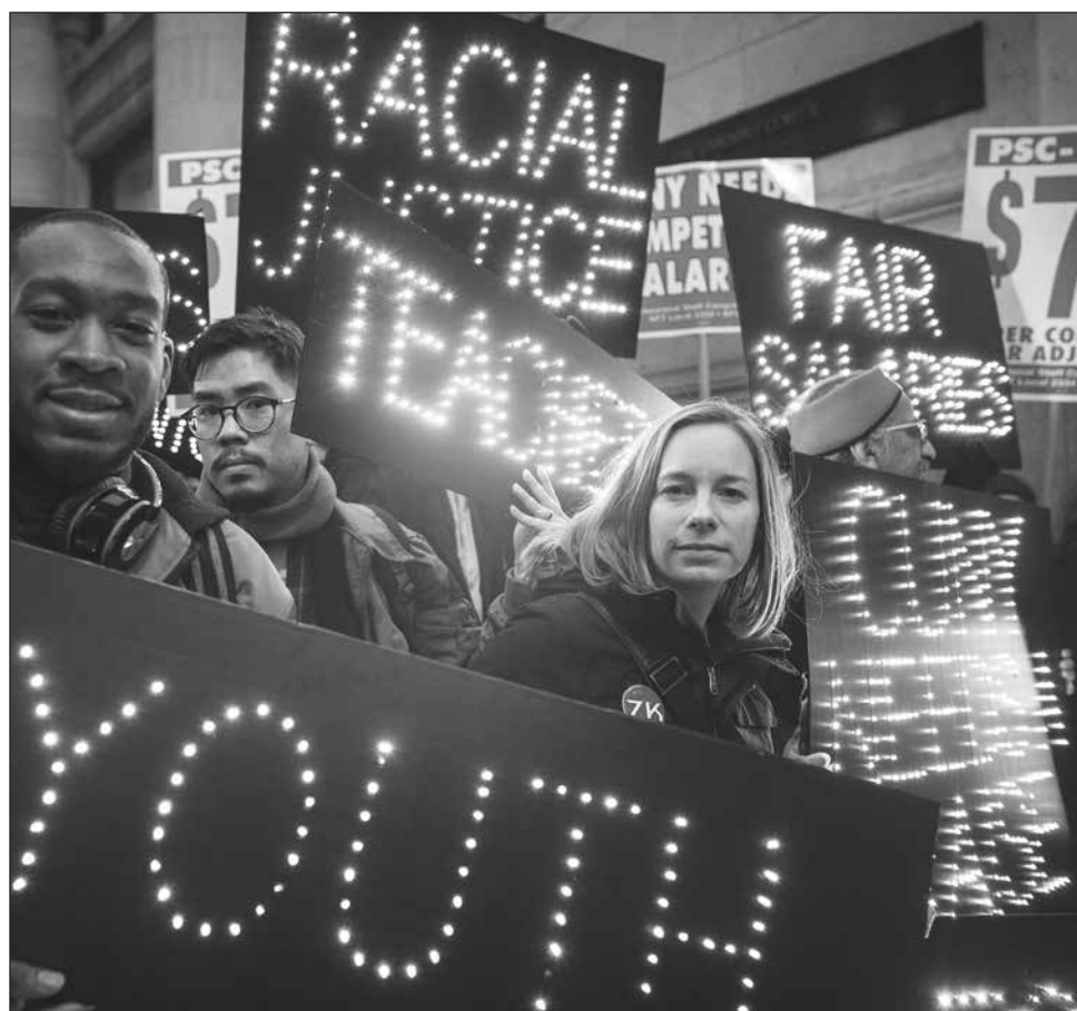
At a December rally soon after the contract expired, PSC members marched through the streets of midtown Manhattan, urging movement on contract talks.

Adjuncts, full-timers and lawmakers stood in solidarity. The transformational contract demand is for $7K per course for adjuncts, more than double the current starting pay.