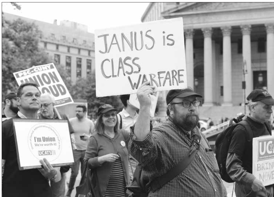
Unions have prepared for a “right-to-work” regime mandated by the courts.

In anticipation of the Janus ruling, anti-union groups such as the State Policy Network, the Freedom Foundation, the Mackinac Center and other groups have engaged in a massive nationwide campaign of targeting union members to try to convince them to stop paying union dues. The groups get public employees’ contact information through public records requests and blitz them with anti-union messaging and information for how to stop paying dues.