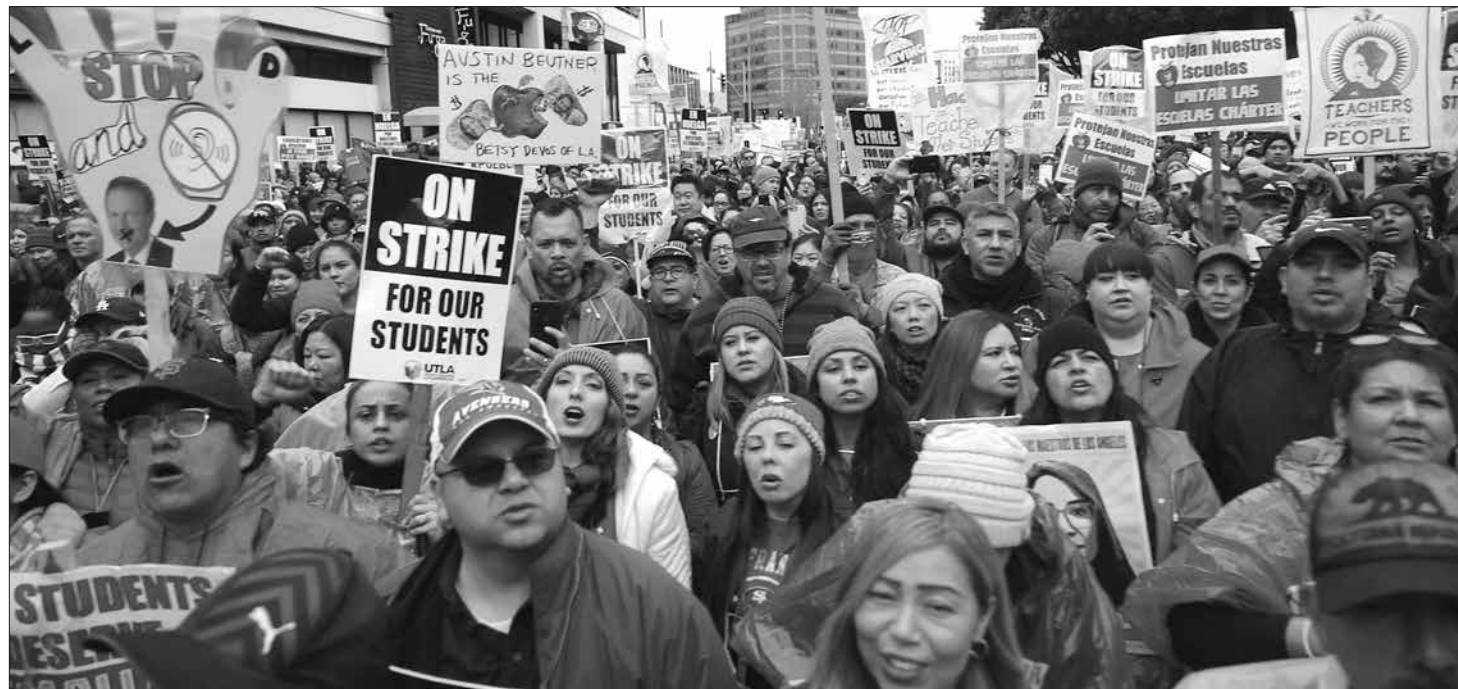
United Teachers Los Angeles ended a weeklong strike in January with a tentative agreement to raise wages, cap class sizes and increase the presence of counselors, nurses and psychologists in schools.