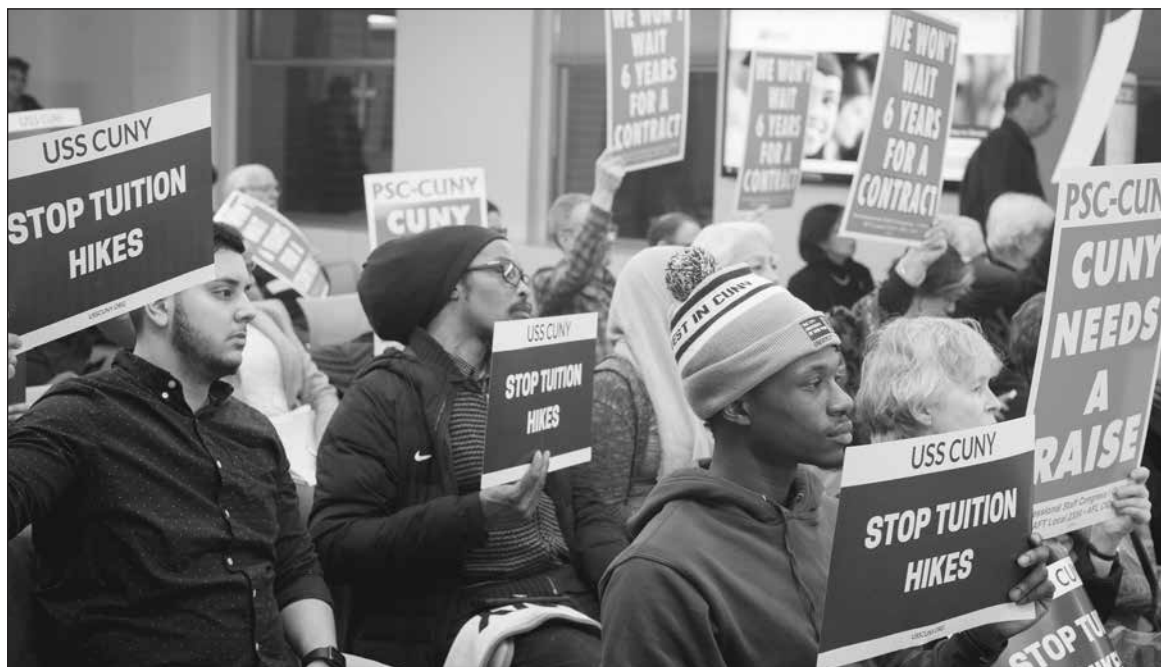
Members protested the vote by the CUNY Board of Trustees to approve a meager budget request that fails to fund mandatory raises and increase adjunct pay.

March 13 – $7K Action Day, Albany and on campus: Members will take part in actions on campuses, worksites and in Albany to pressure lawmakers to address the issue of lifting poverty wages for adjuncts.