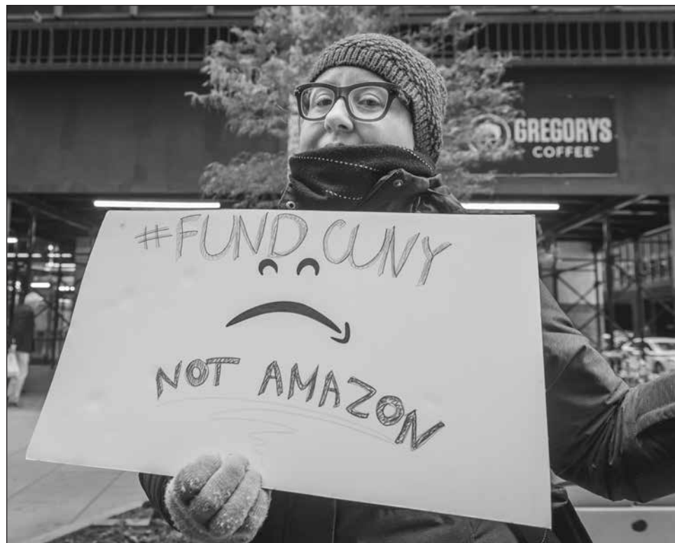
Protestors from the CUNY community insist hundreds of millions of dollars of public funding should support public higher education and not subsidies to corporate behemoths.

● As part of the agreement, New York State will provide up to $1.2 billion in "Excelsior tax credits," in addition to other subsidies using public funds. If Amazon fulfills its promise to create 25,000 jobs in New York, the amount