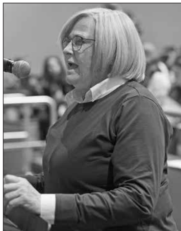
Retirees spoke out at a December CUNY Board of Trustees hearing.