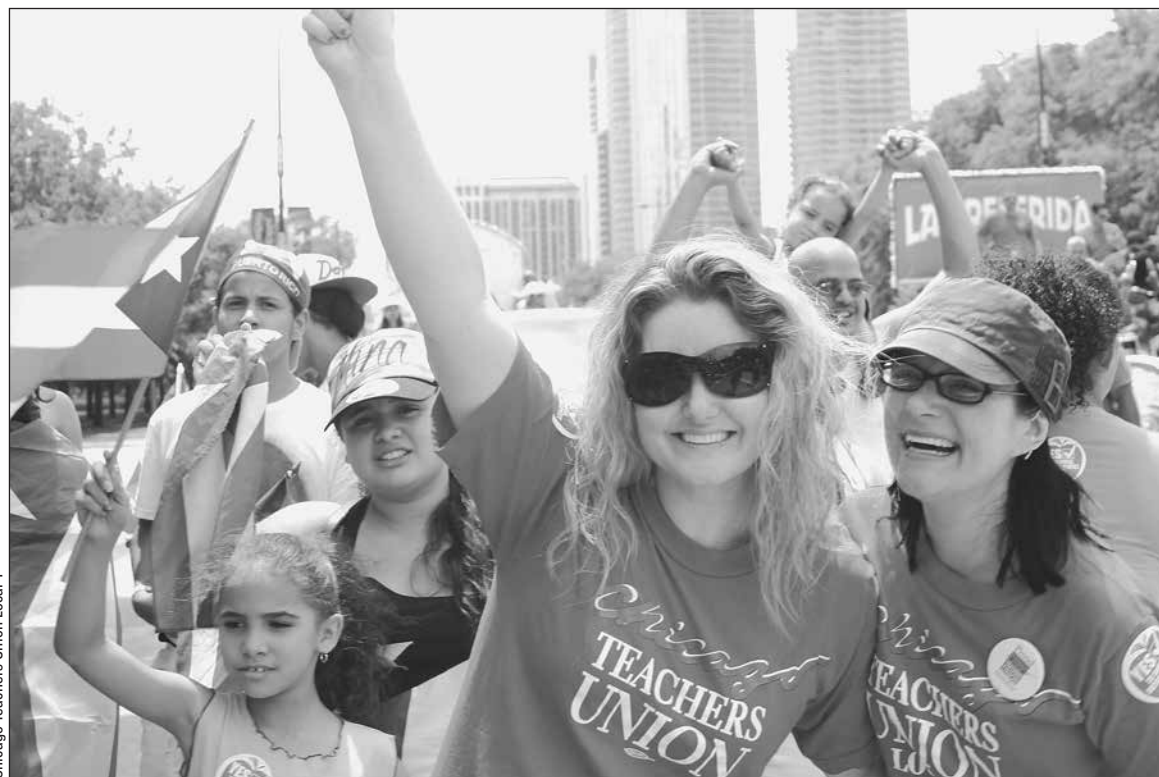
Chicago Teachers Union Local 1

The Chicago teachers union has energized teachers, parents and students to fight for better public schools.