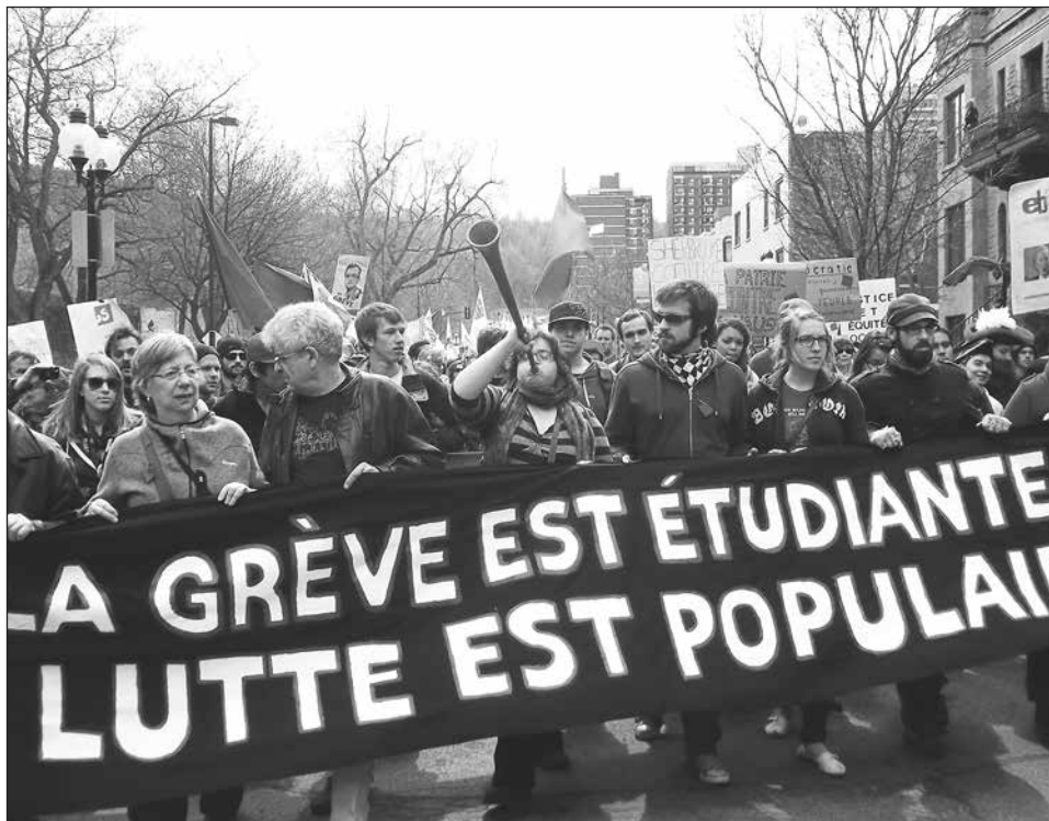
Quebec students and their supporters march through the streets of Montreal in April. The banner reads, “It’s a student strike, it’s a people’s struggle.”

During conversations with our comrades we often expressed disbelief at the size and success of the strike and at the prevalence of red squares. In response people simply said: “Yes, but we have been working for two years to get here.” And it is true. The