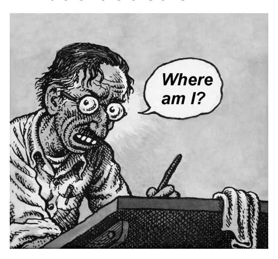
With thanks to R. Crumb

I'm hurrying down a hallway, classrooms on either side. I'm late, very late. Where is the classroom? My students will be getting restless, annoyed, fidgety. Then, instantly, I find myself in a classroom. The students look up. I don't recognize them. I decide to talk about the book I assigned. I haven't read it. What can I do? What ever can I do?