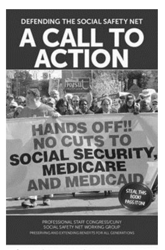
Cover of the new safety net booklet

EMBARKS ON NEW STATE-WIDE INITIATIVE. Attacks on our nation's social safety net have been fierce, well-funded and sustained over the past 35 years. When the GOP takes control of the U.S. Senate in January, new efforts to cut programs like Social Security, Medicare and Medicaid will surely be on their agenda (with, unfortunately, help from some Democrats). As retirees, we must fight with a new urgency to keep and expand the benefits that we have earned.