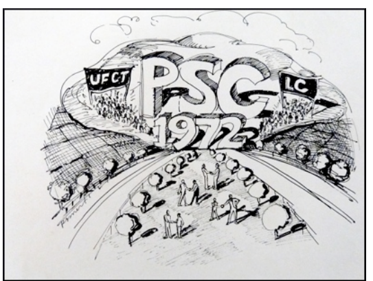
Image (circa 1972) symbolizing the merger of the Legislative Conference and UFCT into the PSC.

pleasure in inviting you to the luncheon on June 18.