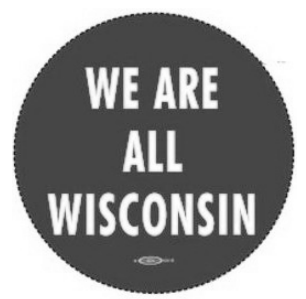
The PSC printed 1,000s of these stickers in red and white

Admittedly, sarcasm and $2.50 gets you on the subway. Let's hope that Wisconsin is the spark that ignites a prairie fire. We need jobs. We need the public sector. We need the labor movement. We need them in Wisconsin. We need them in New York. We need them across the country.