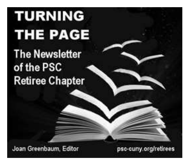
Academic Year 2019-20 No. 5