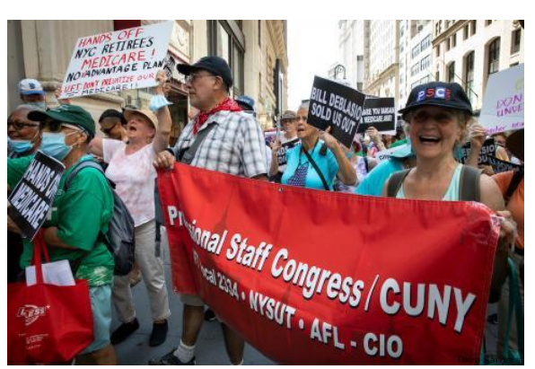
PSC joined a march & rally in lower Manhattan last June.

Lobbying elected officials, in person and through letter writing campaigns, has supplemented the marches and street theater. CROC has attracted considerable media attention and participation in its actions well beyond its original core.