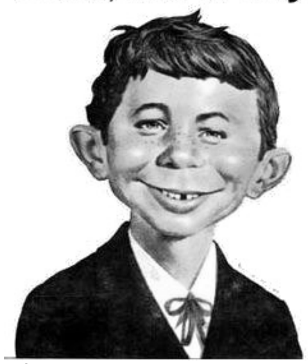
A figure our generation can relate to, even those of us overwhelmed by angst: Alfred E. Neuman of Mad Magazine fame (circa 1950s).

Retiring changed that, eventually freeing me to speak my mind more forthrightly – and, I think, fearlessly. In a very important sense, it was liberation on a personal level.