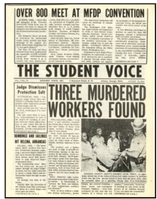
The Student Voice, the 1964 newspaper that SNCC published in Mississippi

Bearing Witness: Mississippi Summer/ Selma