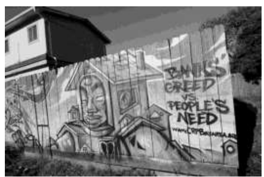
Anti-gentrification mural in Oakland, CA

New York City has one of the highest rates of income inequality in the nation. Large portions of neighborhoods like Williamsburg, Long Island City and the East Village have been gentrified, turned into upper-middle-class oases, and big money has taken over large pieces of Manhattan where even the upper middle class has been priced out. Clearly, there's a human cost to gentrification, but in some cases the restored buildings and new businesses will help revive the city and neighborhood's economic life.