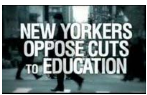
The PSC bought TV ads

million. As enrollment continues to increase, as federal stimulus funds run out, and as tax surcharges expire, enactment of the proposed budget cuts will prove devastating to public higher education here in New York City.